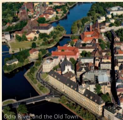
Odra River and the Old Town