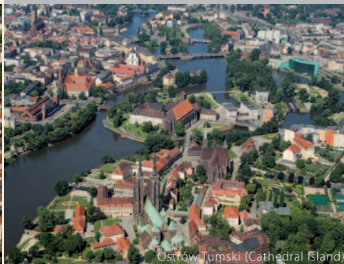
Ostrów Tumski (Cathedral Island)