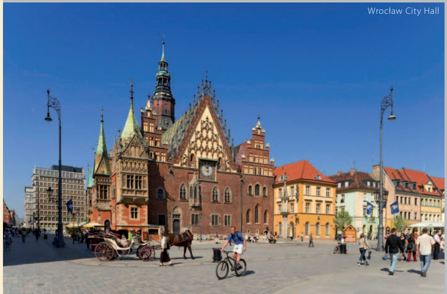
Wrocław City Hall